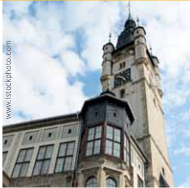
The Foreign Residents Office for Dessau-Rosslau is in the Town Hall.